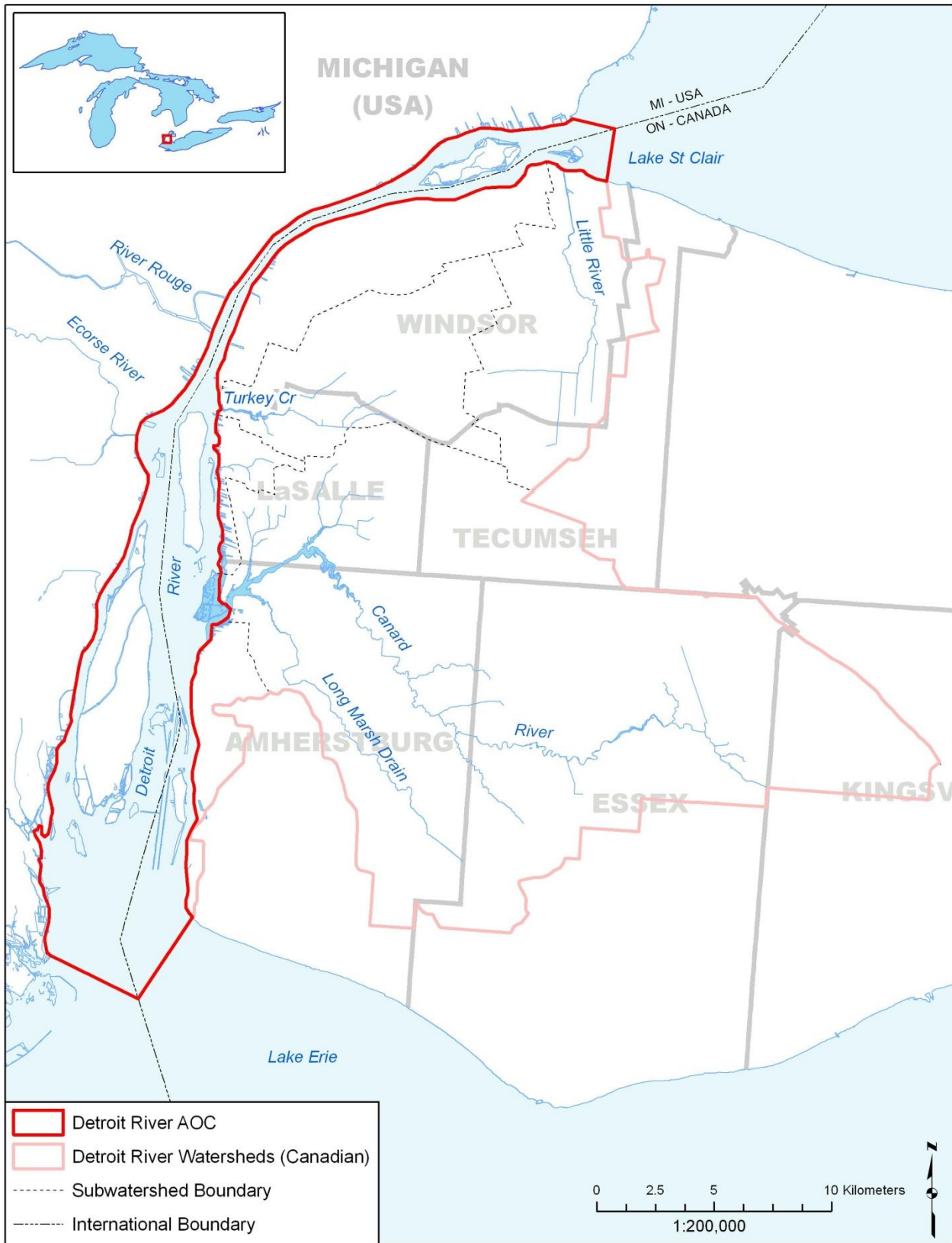
Figure 1. A map of the Detroit River AOC and its Canadian watersheds.