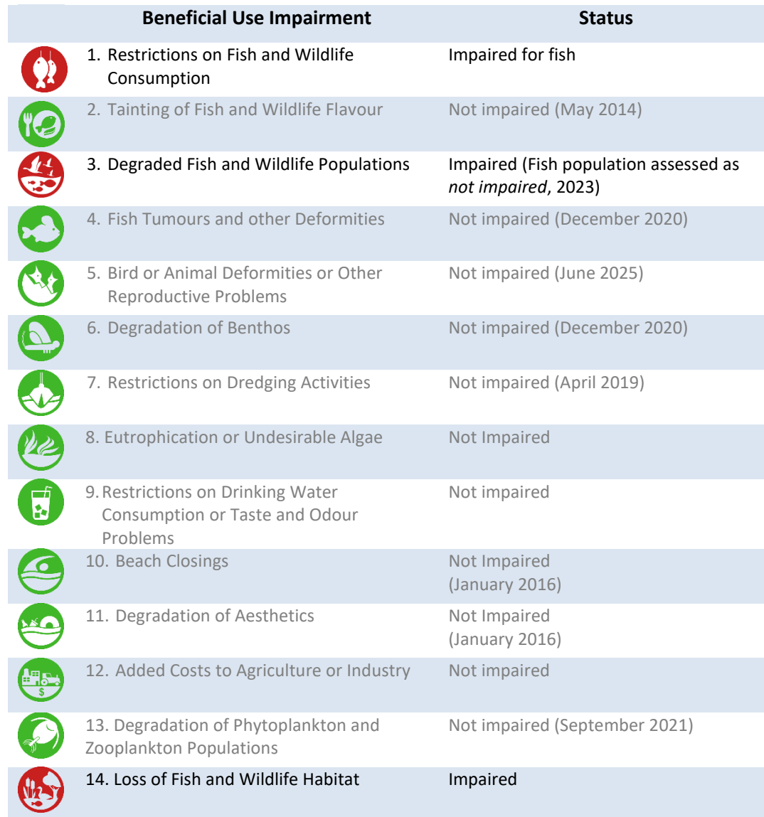
Table 1. Status of BUIs for the Detroit River Canadian Area of Concern as of March 2026.